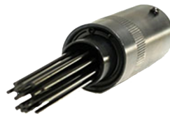
Needle Scaler Attachments